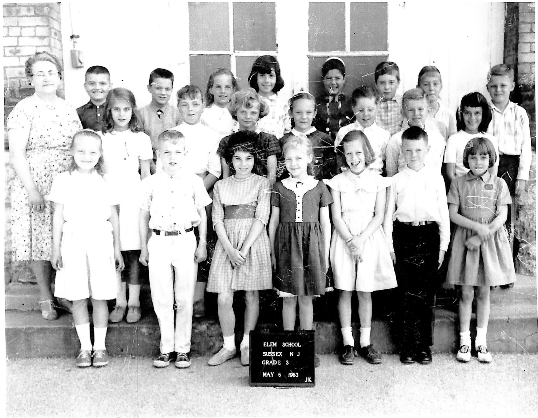
ELEM SCHOOL SUSSEX N J GRADE 3 MAY 6 1963 JK