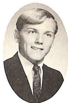
GREGORY FRANCE King of Siam

(P. S. - Dedication is shaving your head ! !)